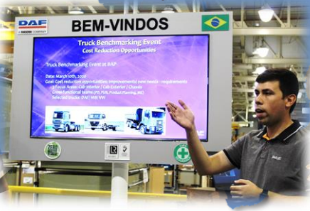
Punta Grossa – Brasil Workshop Area