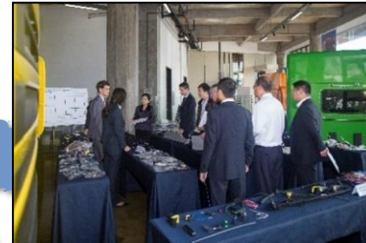
Shanghai - CN Workshop Area