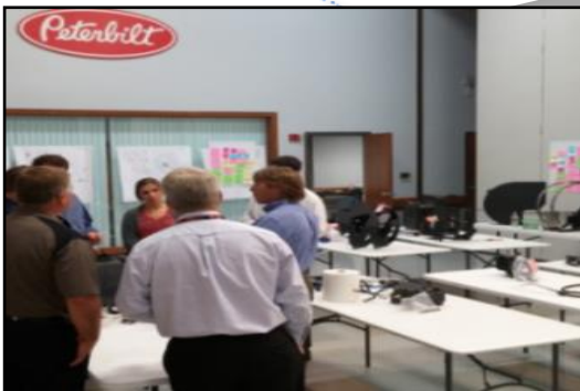
Denton (TX) - US Workshop Area