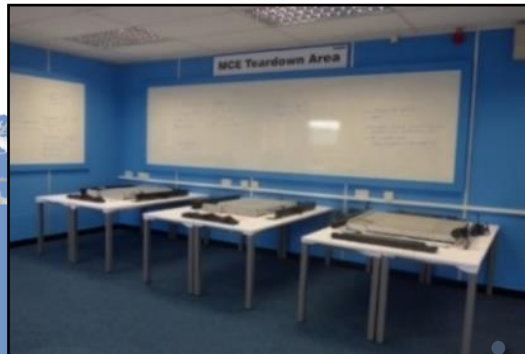
Leyland - UK Workshop Area