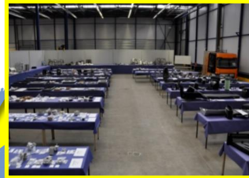
Eindhoven - NL Benchmark Center